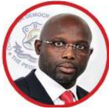
Senator George Manneh Weah