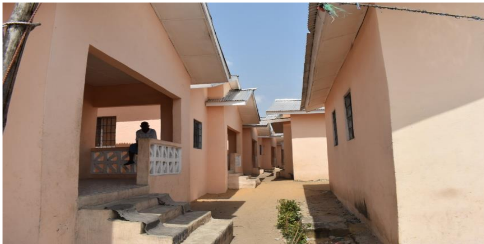
Photo of the Construction of New Kru Town Fire Victims Homes