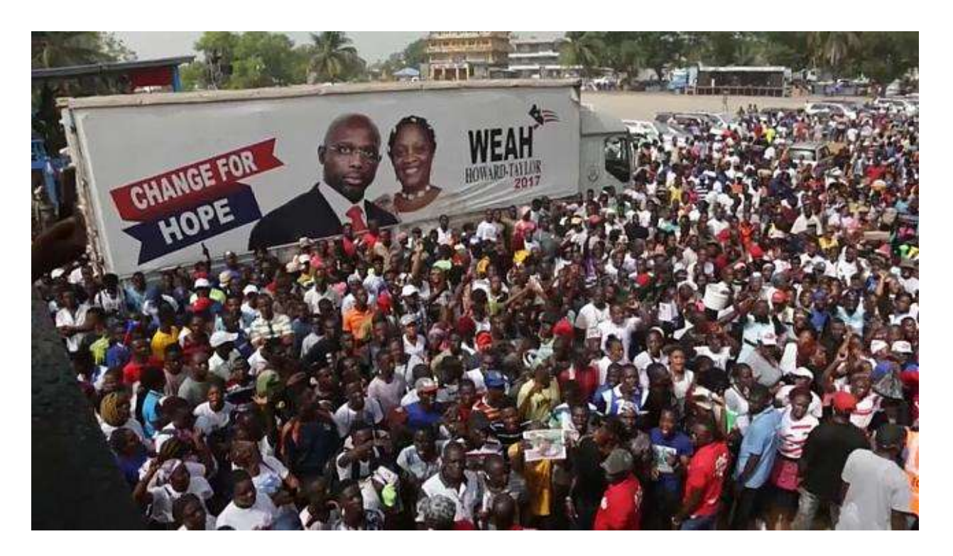
Figure 1: Promises documented to have been completed since the Weah-led government came to office in 2018.

The completed promises are shown in the infographic below.